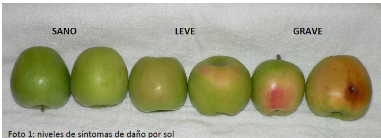
Photo 1. - Levels of symptoms sunburn on fruit.

The weight and diameter of the fruits harvest; was determined on 50 fruits /tree, and measured in 5 trees per treatment (Total of 250 fruits for each treatment). Equatorial diameter was recorded, to estimate size and weight of fruit. The flesh firmness evaluation was performed on samples of 20 "HEALTHY-SANO" fruits selected at random from each treatment. For flesh firmness determination, used a handheld pressure gauge (model FT 327, R. Bryce, Alfonsine, Italy), set to piston of 11 mm.